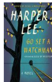
Go Set A Watchman by Harper Lee